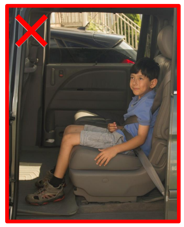
The belt was uncomfortable and the child moved it under his arm. Is this safe? What could happen?