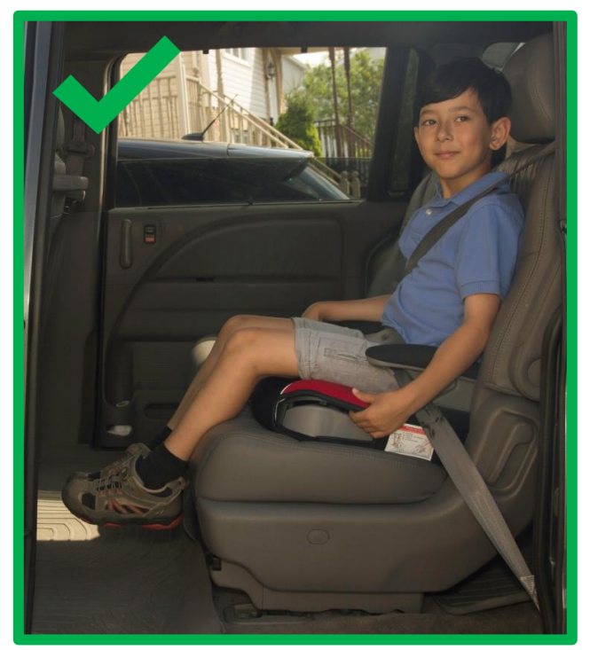
A booster seat is more comfortable and it keeps the belt in the right places to keep him safe!