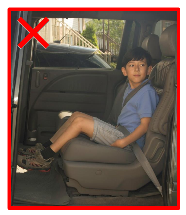
This child looks like he fits the seat belt without a booster seat – but his knees do not bend over the seat and he starts to get uncomfortable.