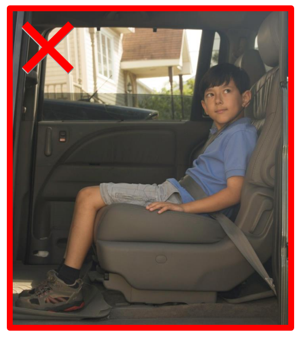
He slouches to get comfortable with his knees over the edge of the seat. What happened to the seat belt? Now the lap belt is up over his belly and the shoulder belt is rubbing his neck.